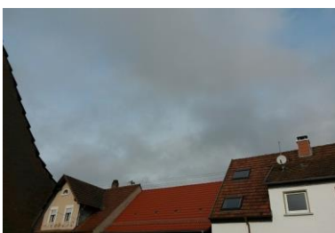
Center roof treated; result after 2 months