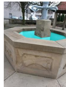
after 10 days