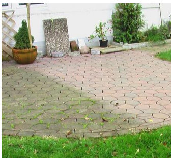
Paving after 3 months