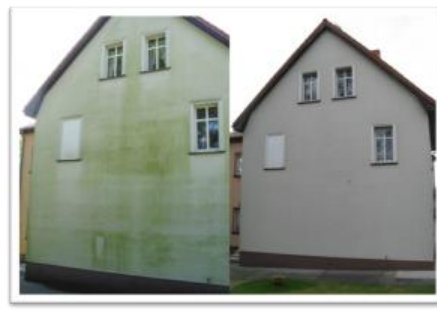
Facade before and after