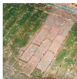
paving treated and untreated